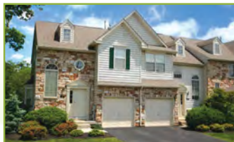
Heritage Summer Hill • Doylestown