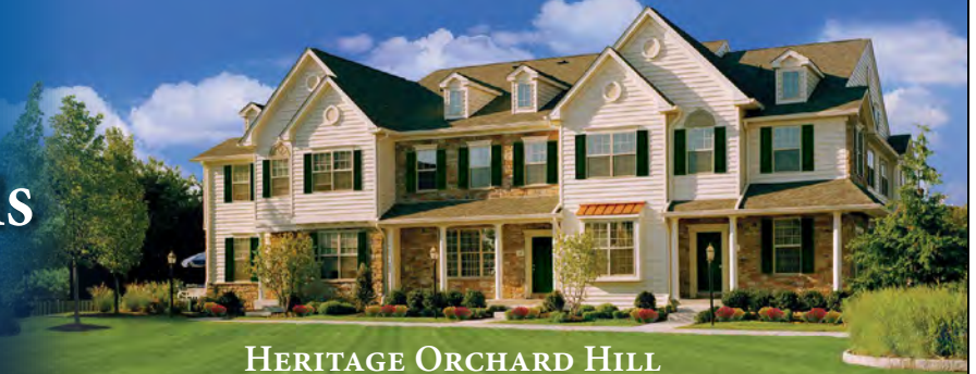
HERITAGE ORCHARD HILL