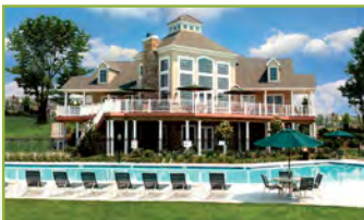
Heritage Orchard Hill - Clubhouse • Perkasié