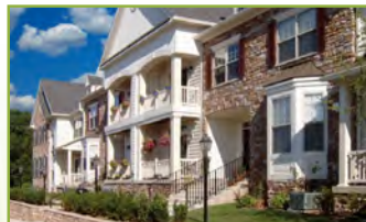
Heritage Greene • Sellersville