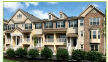
Heritage Pointe • Chalfont