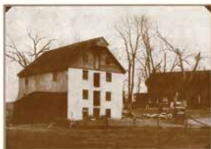
This photo of Masons Mill, taken in the 1950's, shows the old Mill and behind it is the farmhouse.

Just the name Masons Mill reveals what occupied the property prior to 1960, when Upper Moreland Township purchased the land for the park that we know and love today. When a sinkhole recently opened up on the park property, it led to a boon for the township and those interested in local history.