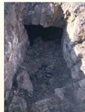
Revealed by the sink hole, this is the hole to the ground as we first saw it upon our first site visit.

We think this root cellar was constructed sometime after 1787, when the mill was built. The root cellar was probably used until the 1920s or 1930s when refrigerators became widely popular. What an exciting thing to find under our very own Masons Mill Park!