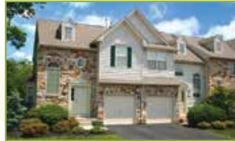
Heritage Summer Hill • Doylestown