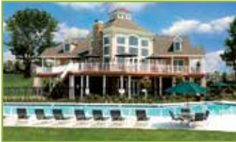
Heritage Orchard Hill - Clubhouse • Perkasié