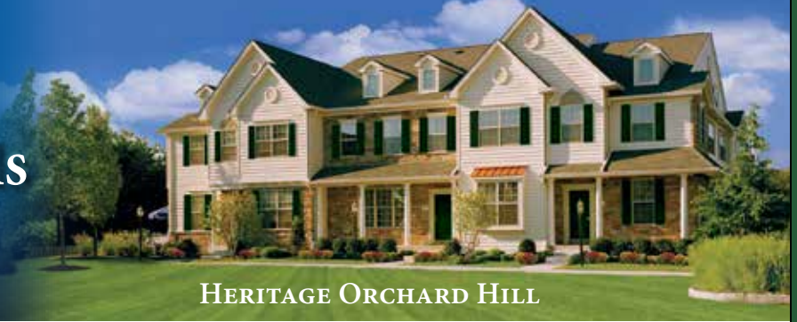
HERITAGE ORCHARD HILL