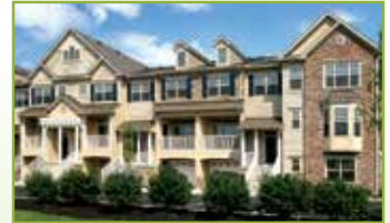
Heritage Pointe • Chalfont