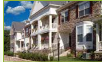
Heritage Greene • Sellersville