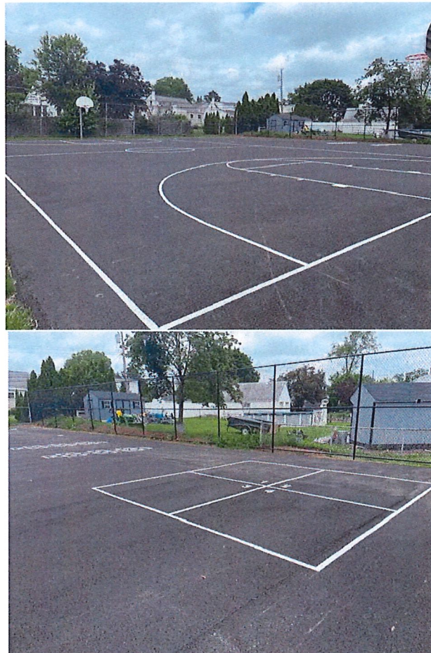
Fern Village Court Painting

UMPR had over 850 participants in recreation programs in June. 721 Residents / 147 Non Residents.