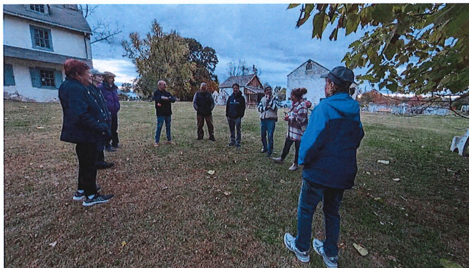
Habitat Heros Program at Farmstead Park