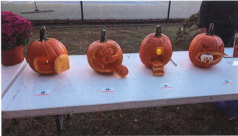
Pumpkins On Parade – Pumpkin Carving Contest

Leagues: Held our third Pickleball League at MM Park; a successful fall league continues through the month (72 participants); Collaborated with Keystone Softball for Fall Men's/Coed League